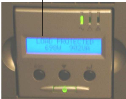
AVP Power Distribution Panel